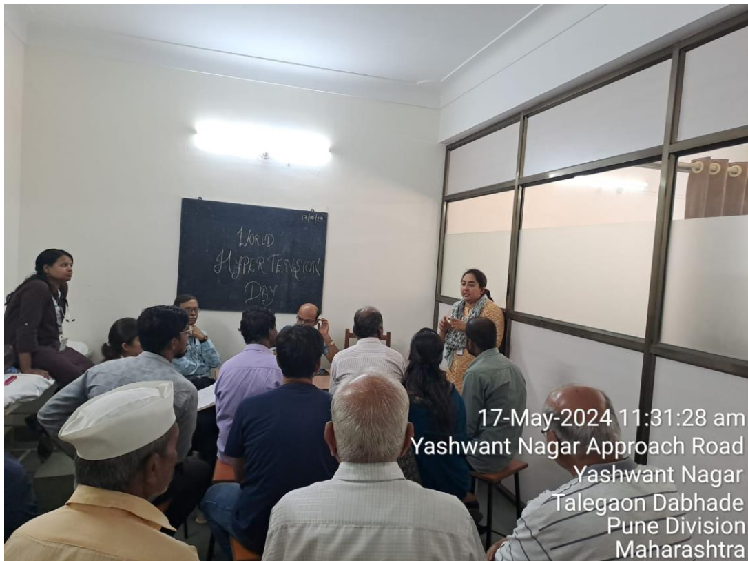
17-May-2024 11:31:28 am Yashwant Nagar Approach Road Yashwant Nagar Talegaon Dabhade Pune Division Maharashtra