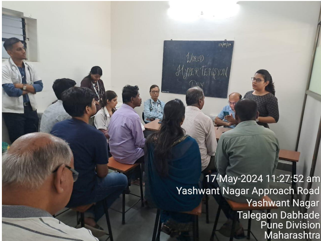
17-May-2024 11:27:52 am Yashwant Nagar Approach Road Yashwant Nagar Talegaon Dabhade Pune Division Maharashtra